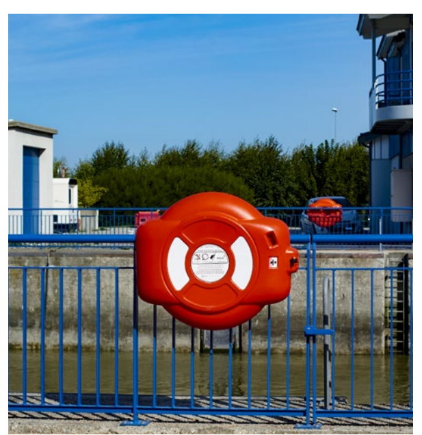
Guardian 600 rail mounted

Royal Life Saving Society UK (RLSS UK) and GoodSAM have partnered to develop a Water Rescue Equipment Register and Life Saving Map. Help save lives by uploading a photo and the precise location of fixed water rescue equipment anywhere in the world so that others can find it in an emergency.