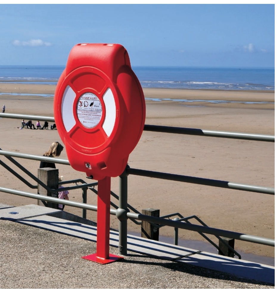
Guardian 750 pole mounted